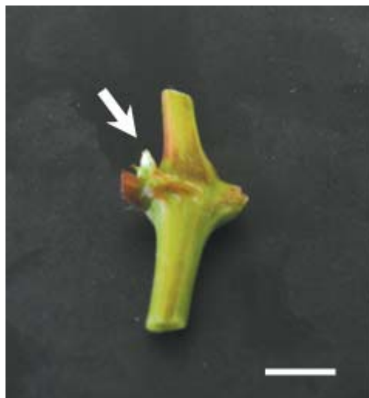
Figure 1. Representative nodal explant used for culture initiation. Arrow indicates an undeveloped lateral bud. Bar = 1 cm.

Previous studies have clearly shown that BA is the most effective among other cytokinins for inducing shoot development in Vitis (Lee and Wetzstein, 1990; Heloir et al., 1997). In this study, development of lateral buds into shoots was also efficient at medium lacking BA. Only the main shoot developed while the growth of axillary buds was inhibited (Figure 2A-B). The presence of BA, even at relatively low levels (i.e., 2.5 and 5.0 \mu\text{M} ), enhanced bud multiplication (Table 1). At relatively high BA concentrations ( >10.0 \mu\text{M} ) axillary bud proliferation was apparent, while at the same time the growth of the main shoot was suppressed.