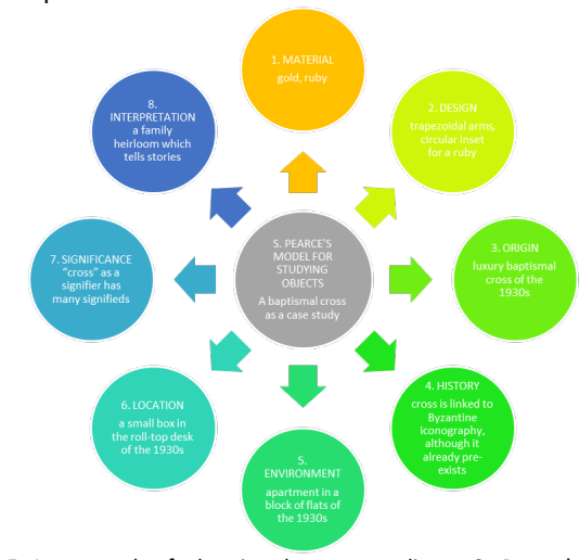
Figure 5 . A case study of a baptismal cross according to S. Pearce's model for studying objects.

This paper contributes to the study of material culture, by exploring the possibility of delving deeper into a number of its fields through a single object. It is examined how an object, specifically a baptismal cross, can be perceived through a broader and more interesting feel for its inherent meaning, instead of exclusively through its narrow morphological sense, using S. Pearce's model for studying objects, a foundation stone in the study of material culture. By implementing S. Pearce's model, it is shown that the interpretative process needs to encompass not only information about the object, but also a new perception of the range of philosophical and technical concepts that shape the interpretation of material culture.