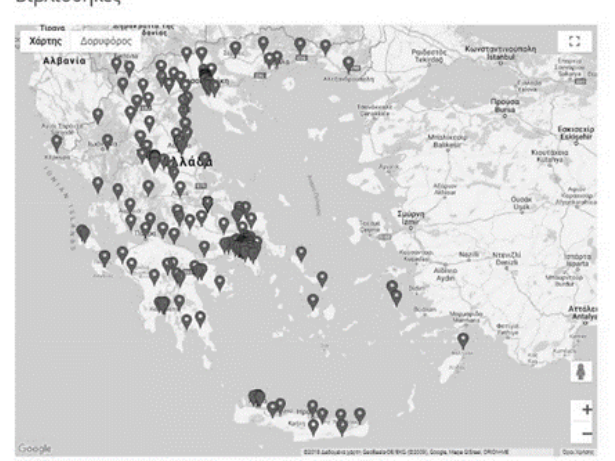
Figure 3. Network.nlg.gr website - Mapping the Libraries of GLN

In addition, the platform created a user area where each library gains access to the system and can manage its profile, participate in projects through special forms, request the workshops that they would like by date, and have access to a communication forum. As soon as a project is announced, all the member-libraries have the potential to apply for the project in which they wish to participate. Each project includes: